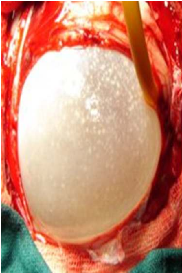
Figure 3. Macroscopic appearance of the giant cerebral hydatid cyst at the opening of the cranial vault