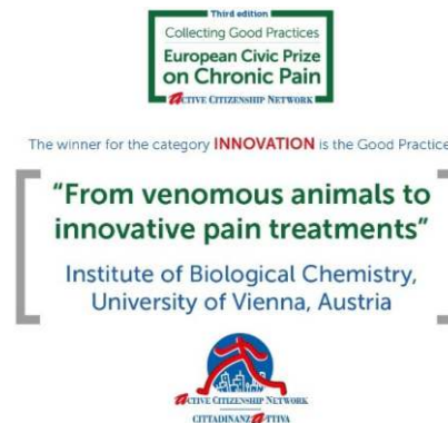
Figure 5 The plaque realized in the occasion of the ceremony of the III Edition of the Prize on June 17, 2021 and given to the Institute of Biological Chemistry of the University of Vienna