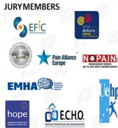
Figure 2 The Jury Members of the III Edition of the “European Civic Prize on Chronic Pain – Collecting Good Practices” came from 9 organizations, apart from Active Citizenship Network