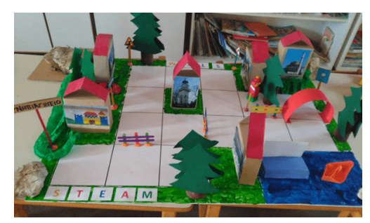
Figure 2 Educational robotics in our kindergarten

technologies offer children and young people opportunities for a practical understanding of things they encounter daily but do not fully understand. These include proximity sensors, motion detectors and light sensors, software errors and connection problems (Wi-Fi, Bluetooth disconnection) (Vidakis et al., 2019).