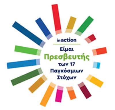
Figure 4 Our students are 17 BA Ambassadors

In 2015, world leaders unanimously endorsed the 2030 Agenda for Sustainable Development. The 17 Sustainable Development Goals are the path that leads us to a fairer, more peaceful, and prosperous world and a healthy planet. It is also an invitation to solidarity between generations. Our students are 17 BA Ambassadors from 2020 (Figure 4).