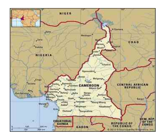
Figure 1. Cameroon Map

elephants, giraffes, hippopotami, and rhinoceros in this area. Maroua has a large market for crafts and museums. The provinces of Adamawa, North, and South offer a new front for tourism industry growth, but weak transport conditions in these regions hold the industry small. Southern forest reserves have little tourist-oriented facilities, but tourists can see primates, lions, gorillas, and other fauna in the rainforest. (see Figure 1)