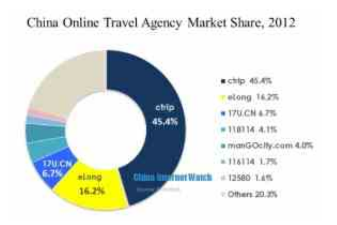
Figure 2. Data on Chinese online market

This section is concerned with the analysis and discussion of various factors influencing the adoption of e-tourism in Cameroon. We resort to descriptive analysis and ANOVA to test differences between mean rankings of three sub-groups; age, gender and country of origin. Chi square was also used to test how well sets of observations fit theoretical set of observation, including whether frequencies observed for rating internet in Cameroon (poor, average or good) fit the expected frequency. These analyses were performed using SPSS. During the survey Tourist participants were asked to rank certain aspects