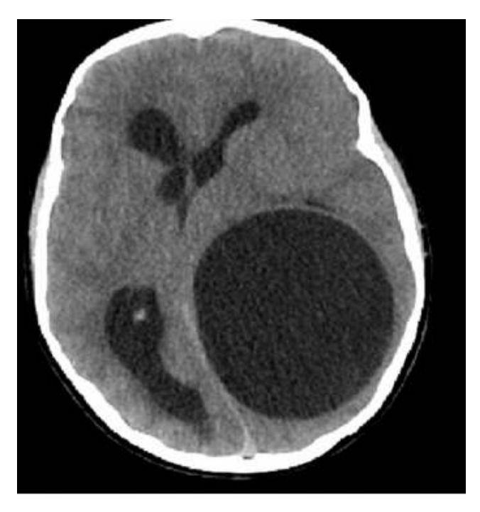
Figure 1. Axial cerebral CT: large left parieto-occipital mass of fluid density with intracranial hypertension and subfalcine herniation.

The post mortem examination concluded to a broken giant cerebral hydatid cyst. No other anomalies or other associated hydatid localizations were found. The search for toxic substances in the blood and gastric fluid was negative.