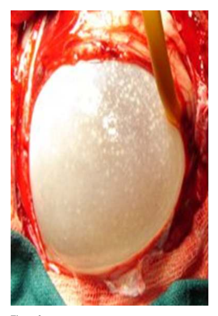
Figure 3. Macroscopic appearance of the giant cerebral hydatid cyst at the opening of the cranial vault